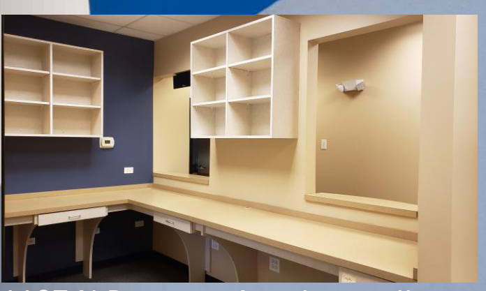
1107 N Prospect Ave, Itasca, IL